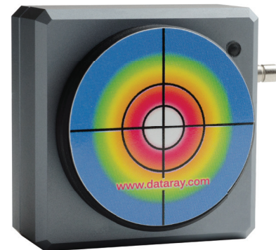
WinCamD-LCM 1.8 x 1.8 x 0.8 in 46 x 46 x 20 mm

The WinCamD-LCM is paired with DataRay's full-featured software which has no license fees, unlimited installations, and free software updates. It is ideal for applications including: CW and pulsed laser profiling; field servicing of laser systems; optical assembly; instrument alignment; beam wander and logging; R&D; OEM integration; quality control; and M^2 measurement with available M2DU stages.